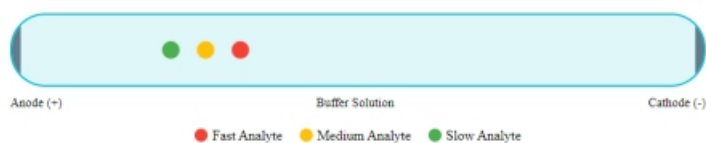
Figure 1: Capillary Electrophoresis Analyte Separation

In CE, separation occurs due to differences in the electrophoretic mobility of ions, which is determined by their charge-to-size ratio [23]. The electroosmotic flow (EOF), generated by the applied electric field, plays a crucial role in the overall migration of analytes [24]. The EOF can be manipulated by altering the capillary surface chemistry or adjusting the buffer composition, allowing for optimization of separation parameters [25].