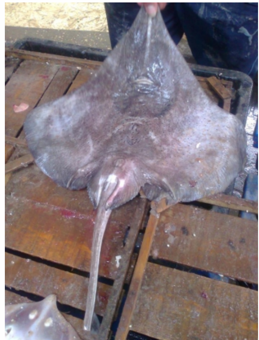
Figure 5: The Longnose Skate ( Dipturus oxyrinchus Linnaeus, 1758) represents the least frequently captured rajid in the marine ecosystem of the Gaza Strip, Palestine