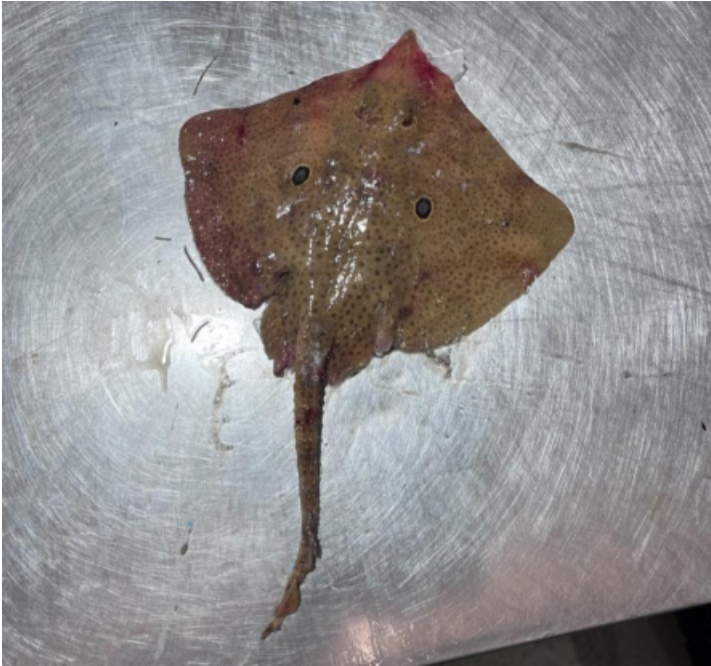
Figure 2: The Brown Ray ( Raja miraletus Linnaeus, 1758) represents one of the most commonly captured rajid species in the Marine Ecosystem of the Gaza Strip, Palestine

The Brown Ray was distinguished by its rhomboidal disc, pointed snout, slender tail, and characteristic eye-like ocelli bordered by dark rings on the dorsal surface (Figure 2). Dorsal coloration ranged from light brown to sandy beige, providing effective camouflage on softbottom substrates. The species was commonly landed as bycatch in gillnet and trawl fisheries operating over sandy seabeds, and fresh specimens were occasionally marketed for human consumption. Local fishermen commonly referred to the species as “Al-Bassa Al-Oyoun” (the eyed skate).