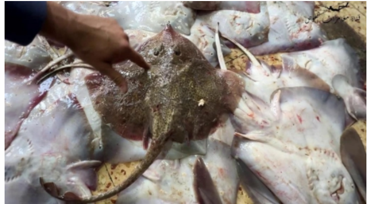
Figure 4: The Thornback Ray ( Raja clavata Linnaeus, 1758) represents one of the commercially rajids from the marine ecosystem of the Gaza Strip, Palestine

The Longnose Skate was characterized by an elongated pointed snout, large rhomboidal disc, relatively smooth dorsal surface, and elongated tail (Figure 5). Most documented specimens were captured incidentally in deeper fishing grounds by trawl nets and longline fisheries. Its occurrence confirms the persistence of deeper-water rajid fauna within the southeastern Mediterranean ecosystem adjacent to the Gaza Strip. Local fishermen commonly referred to the species as “Al-Saroukh” (the rocket).