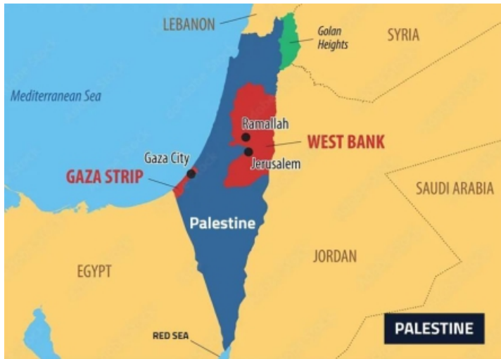
Figure 1: Map of Palestine showing the geographical location of the Gaza Strip along the southeastern Mediterranean coast, extending approximately 42 km in length and covering an area of about 365 km 2