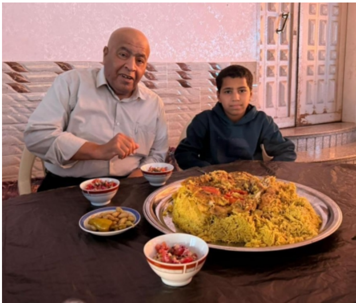
Figure 6: The lead researcher and his son before consuming the traditional Palestinian dish "Sayadieh," a coastal specialty in the Gaza Strip made of fish and rice with caramelized onions, olive oil, and spices, typically served with salads and side dishes

The utilization of rajid skates in the Gaza Strip varied according to market demand, body size, and prevailing socioeconomic conditions. Historically, skates were considered of relatively low commercial value compared with many bony fishes. However, economic hardship, food insecurity, and declining fish availability have increased their importance as a source of affordable protein. Fresh specimens were marketed whole or partially processed, with larger species such as the Thornback Ray and Longnose Skate commonly cut into portions before sale. Skate flesh was usually consumed fried or grilled, while smaller or damaged individuals were occasionally utilized as bait or animal feed. Rajid flesh was also incorporated into traditional Palestinian seafood dishes, particularly "Sayadieh," a popular coastal meal consisting of fish and rice cooked with caramelized onions, olive oil, and spices, and commonly served with salads and side dishes (Figure 6). During periods of fish scarcity and recurrent wars in the Gaza Strip, skate meat represented an alternative food resource, especially the white flesh of larger species.