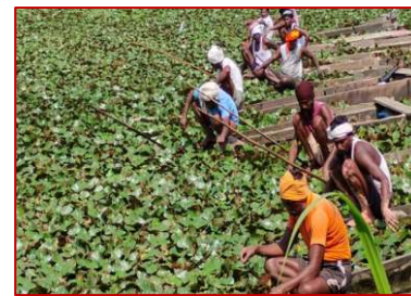
Harvesting of Crop