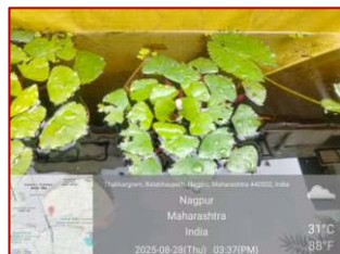
Flowering of Trapa natans L.

Water samples were analyzed following standard protocols (APHA methods) for the following parameters: pH (pH meter), Temperature (Thermometer), Dissolved Oxygen (DO), Total Dissolved Solids (TDS), Total Hardness, Nitrates and Phosphates.