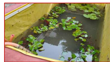
Trapa natans L. at study site College

Photo Plate 1: Showing habit, habitat and collection of Trapa natans L. at study site