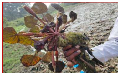
Twig of Trapa natans L.