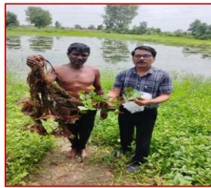
Singada crop at study site