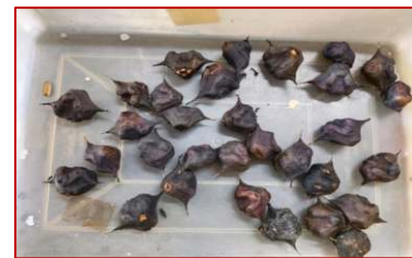
Singada fruit for analysis at Laboratory