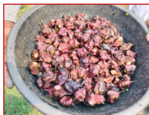
After Harvesting of Singada